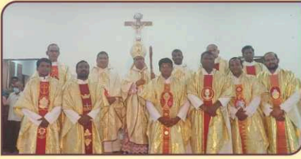
Blessing of St Mother Theresa Multipurpose Centre, Thindal