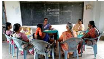
Kinathukadavu UWFT Meeting