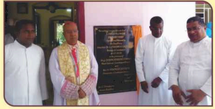
Blessing the Renovated Presbytery, Kolappalur