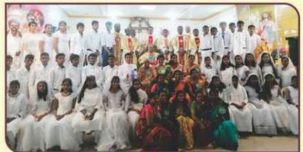
Feast, Holy Communion and Confirmation, Ganapathy