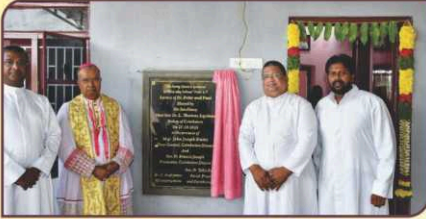
Blessing the Renovated Presbytery, Valipalayam