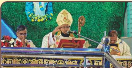
Feast Mass, Karumathampatti.