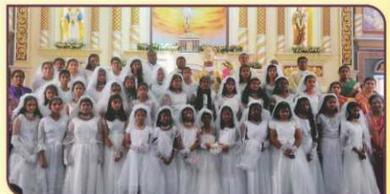
Flag Hoisting, Holy Communion and Confirmation, NGGO Colony