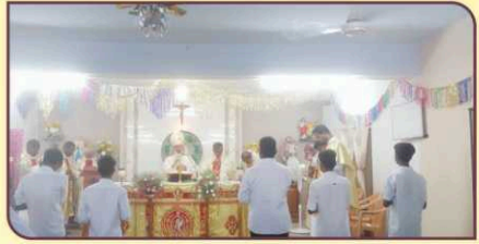
St. Michael's Feast, Generalate, Karumathampatti

Wish You a Long Life and Good Health on Your Birth Day