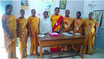
Valparai –UWFT Meeting