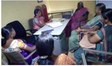
Coimbatore UWFT Meeting