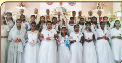
Feast, Holy Communion and Confirmation, Othakkalmandapam