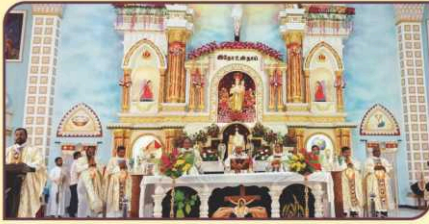
Legion of Mary Jubilee Mass, Karumathampatti