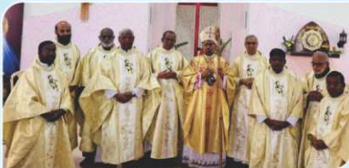
Feast Mass Cottolongo Convent, Sowripalayam