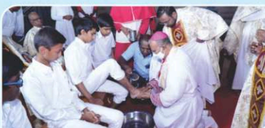
Maundy Thursday Mass, Cathedral