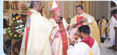
Chrism Mass, Cathedral