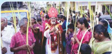
Palm Sunday, Cathedral