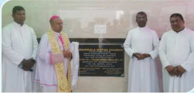
Blessing of New Presbytery, Kannampalayam