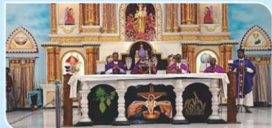
First Saturday Mass, Karumathampatti