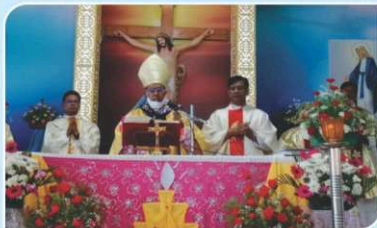
Easter Mass, Visuvasapuram