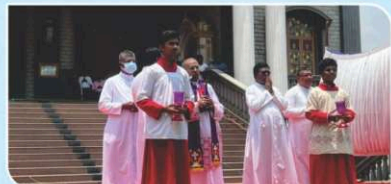
Good Friday Way of the Cross, Cathedral