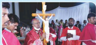
Good Friday Service, Cathedral