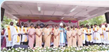
Final Profession Mass, IC Convent