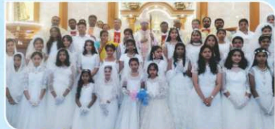
Feast, Holy Communion and Confirmation, Ramanathapuram