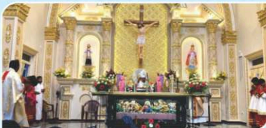
Holy Mass, Palladam