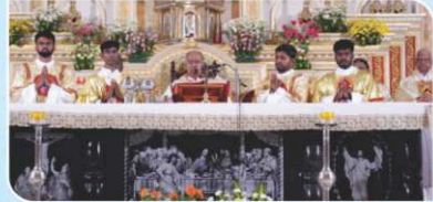
Dioconate Ordination, Cathedral