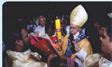
Easter Vigil Mass, Cathedral