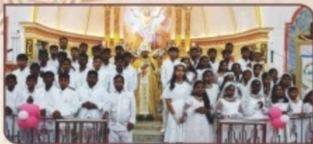
Feast Mass, Holy Communion and Confirmation, St. Catherine's Church, Tirupur Town