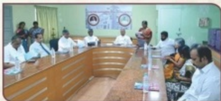
General Body Meeting, CMSSS