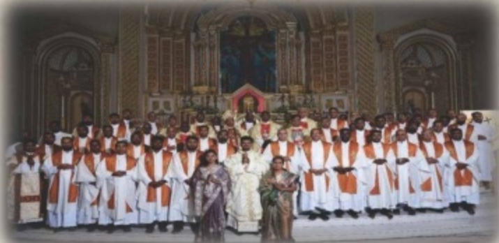
Priestly Ordination Mass, St. Michael's Cathedral