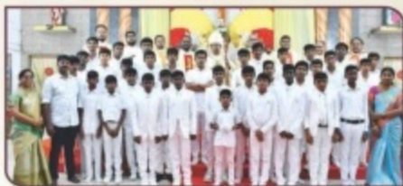
Feast Mass, Sacraments of Holy Communion and Confirmation and Blessing of Adoration Chapel, St. Joseph's Church, Kumar Nagar