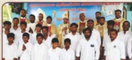
Sacraments of Holy Communion, Confirmation and Blessing of Grotto, Arokia Annai Church, Anamalai