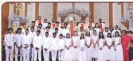
Feast Mass, Sacraments of Holy Communion and Confirmation, Church of Resurrection, Ramanathapuram