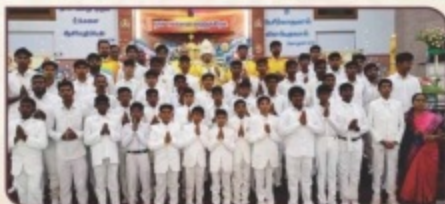
Sacraments of Holy Communion and Confirmation, St. Paul's Church, Rathinapuri