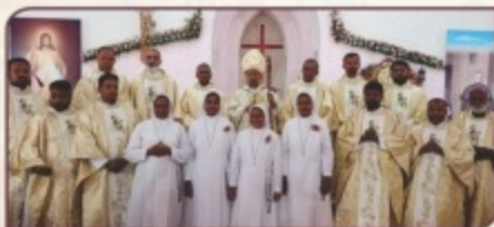
First Profession Mass, Cottalengo Convent, Sowripalayam