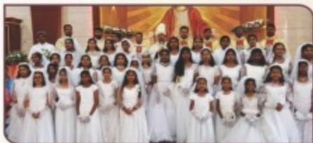
Feast Mass, Sacraments of Holy Communion and Confirmation, St. Joseph's Church, Podanur