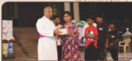
Catechism Annual Day, St. Michael's Cathedral, Coimbatore