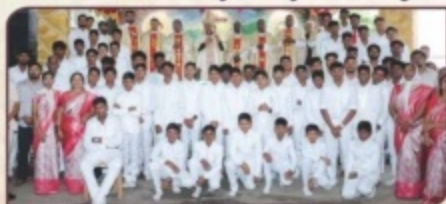
Sacrament of Holy Communion & Confirmation- St. John Bosco Church Goundampalayam