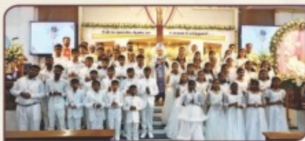
Feast Mass, Sacraments of Confirmation, Our Lady of Fatima Church, Gandhipuram.