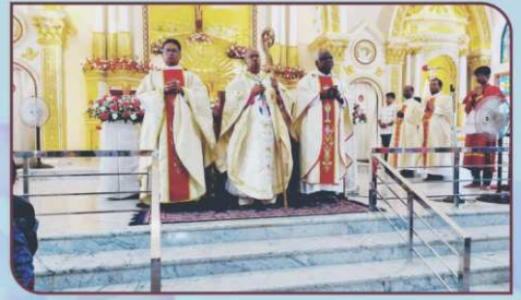
Feast mass, St. Sebastian Church, Sitra.

Feast of the Holy Inncoents, St. Michael's Cathedral.