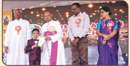
School Annual Day Celebration, Carmel Garden Public School, Sungam.