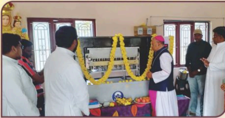
New Project Launching, Manous Garden, Mettupalayam