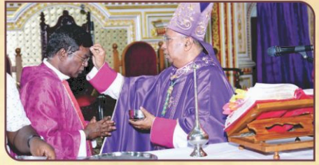
Ash Wednesday, St. Michael's Cathedral.