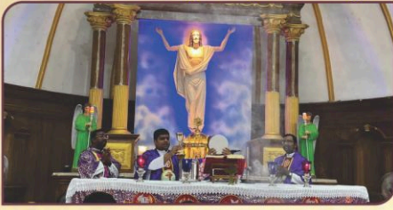
Ash Wednesday, St. Catherine's Church.