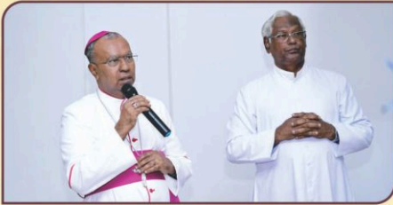
Blessing of New Canteen, Bishop Ambrose College, Sungam.