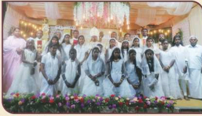
75th Jubilee, Communion and Confirmation, Kilambady