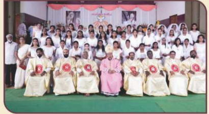
Feast, Holy Communion and Confirmation, Ondipudur