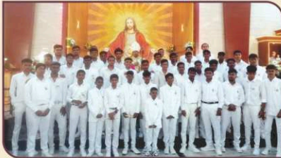
Feast, Holy Communion and Confirmation, Podanur.