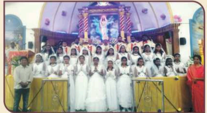
Feast, Holy Communion and Confirmation, St. Catherine's Church, Tiruppur