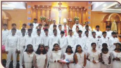
Holy Communion and Confirmation, Pollachi.