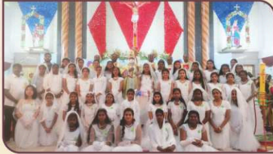
Feast, Holy Communion and Confirmation, Kumar Nagar, Tiruppur.