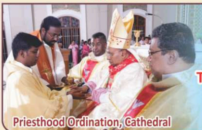
Priesthood Ordination, Cathedral