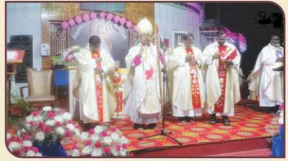
Feast Mass, Kuniyamuthur