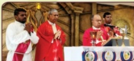
Holy Mass, TamilNadu Family Commission, Jeeva Jothi Ashram, Coimbatore