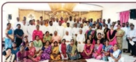
TamilNadu Family Commission Meeting, Jeeva Jothi Ashram, Coimbatore