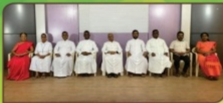
Board Meeting, CEEMA, Thindal