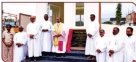
St. Michael's Mat. School, Jubilee Arch Blessing, Coimbatore