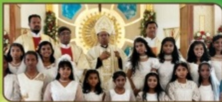
Feast Mass, Sacraments of Holy Communion, Confirmation Mass, St. Antony's Church, Vadavalli