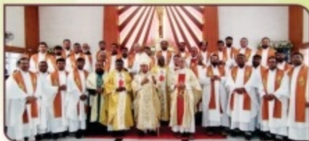
Jubilee Mass and Sacraments of Holy Communion and Confirmation, Holy Trinity Church, SIDCO