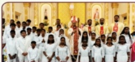
Sacraments of Holy Communion, Confirmation Mass, Our Lady of health Velankanni Church, Palladam