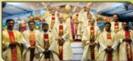
Feast Mass, St. Antony's Shrine, Poomalur