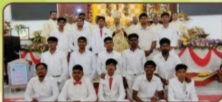
Feast Mass, Sacraments of Holy Communion, Confirmation Mass, St. Antony's Shrine, Puliakulam